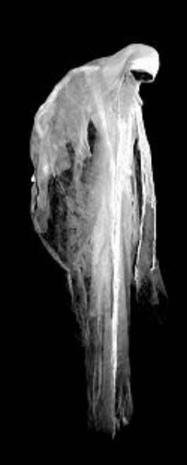
2 Timothy 1:7 (ESV): "For God gave us a spirit not of fear but of power and love and self-control."